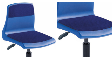
Seat & Back Pad SBP