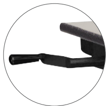
Side crank handle example