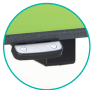
Adjustable Height Motorised*