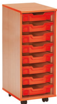
1 Column, 8 Trays