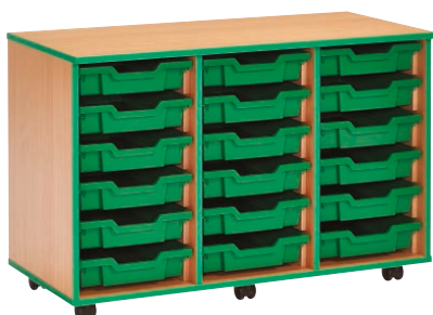
3 Columns, 18 Trays