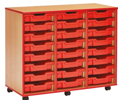
3 Columns, 24 Trays