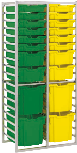
2 Columns, 36 Trays*