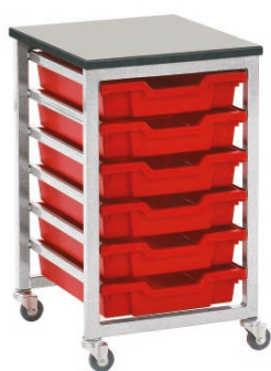
1 Column, 6 Trays With Castors