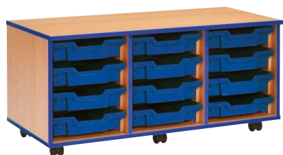
3 Columns 12 Trays