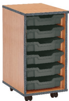
1 Column, 6 Trays